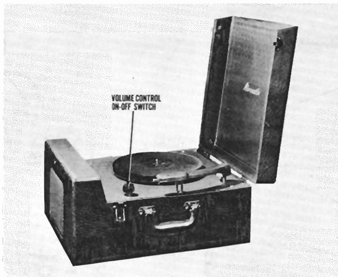
AIRCASTLE MODEL 621

TRADE NAME Aircastle Model 621 (Ch. FJ-91) SUPPLIER Spiegel Inc., 1061 W. 35th St., Chicago, Ill. TYPE SET AC Operated Portable Phono. with 2 Tube Amplifier & Speaker TUBES (TWO) Types, 50A5 Power Amplifier, 35Y4 Rectifier. POWER SUPPLY 105-125 Volts AC RATING .235 Amps. @ 117V AC