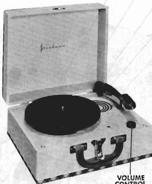
VOLUME CONTROL ON-OFF SWITCH