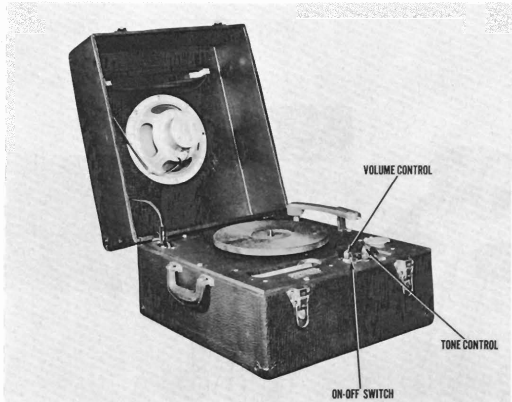
MUSITRON MODEL PT-10

TRADE NAME Musitron, Model PT-10 MANUFACTURER The Musitron Co., 223 W. Erie St., Chicago 10, Ill. TYPE SET AC Operated Phonograph with 4 Tube Amplifier & Speaker TUBES (FOUR) Types, 7N7 AF Amp.-Phase Inv. (2) 7C5 Power Output, 7Z4 Rectifier. POWER SUPPLY 110-120 Volts AC RATING .580 Amp. @ 117 Volts AC